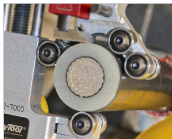
Extra rollers provide tool stability on a range of cable sizes.