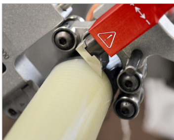
Unique blade shape leaves surface of insulation extremely smooth.