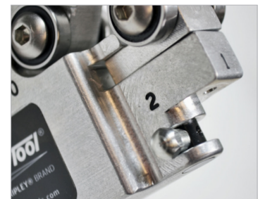
Equipped with four speed positions to optimize performance.