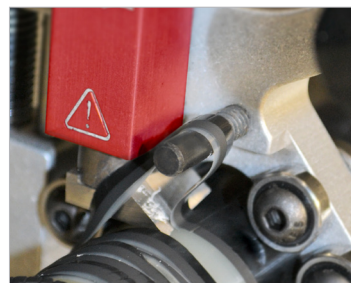
Winding pin keeps semi-con strip from getting in the way.