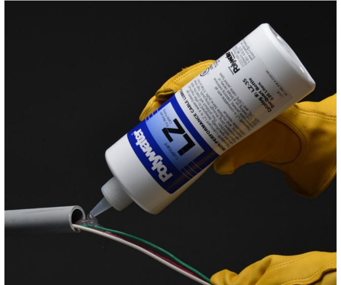
Polywater LZ is a specification grade lubricant

Coefficient of friction data on additional or specific cable jackets or conduits can be obtained from American Polywater Corporation.