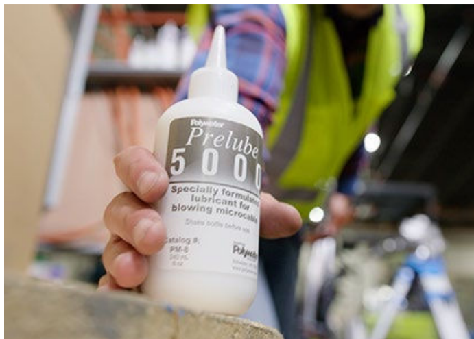
Prelube 5000 applied to duct prior to blowing fiber cable